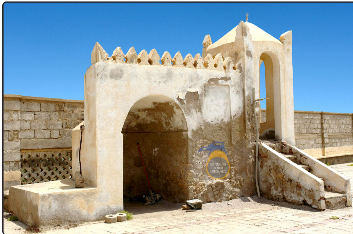
Where Islam first touched Africa. The Sahaba Mosque—a sanctuary of faith since 615 AD.

This foundational history is also preserved at the monastery of Debre Libanos of Ham, the second-oldest monastic site in