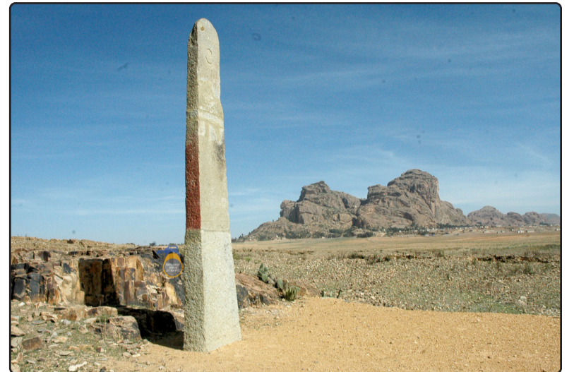
Metera- Carved in stone. A crescent and a disk—Eritrea’s ancient faith, written for eternity.

The structural and spiritual legacy of the ancient civilization has profoundly shaped Eritrea’s modern cultural and physical landscape. Today, the high plateaus and cliffs are dotted with ancient rock-hewn churches and monasteries that seem to grow