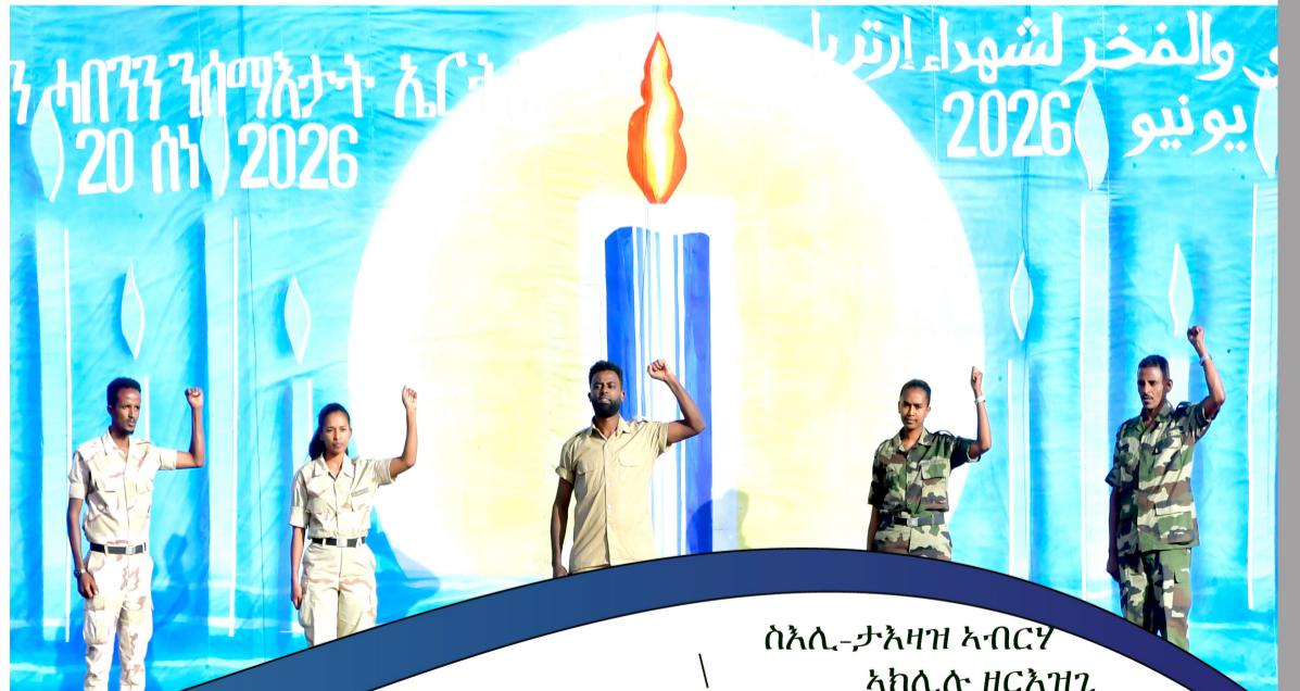
ዲዛይን - ታእዛዝ አብርሃ

ስኢሊ-ታእዛዝ አብርሃ አክሊሉ ዘርእዝጊ ክብርም ጸሃዩ አብርሃም በዩን