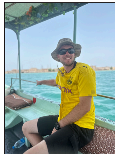
Heading to Green Island

Yes. People often think Africa is one monolithic thing—all savannahs and safaris. Eritrea shatters that stereotype. The streets of Asmara feel almost European, but layered with