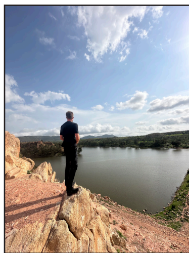
Himberti Natural Lake