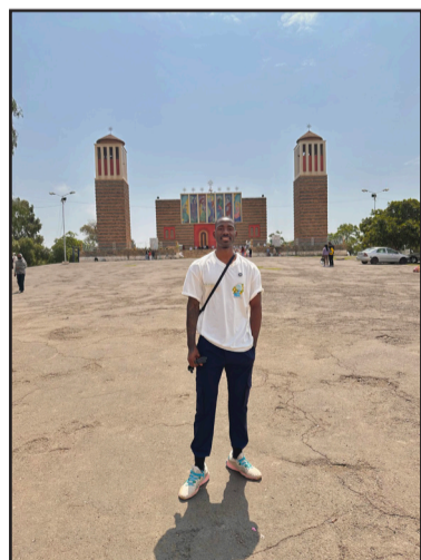
In the compound of Enda Maryam